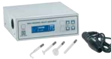
9376 High Frequency £279.00