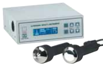
9369 Ultra Sonic £329.00