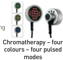
Chromatherapy – four colours – four pulsed modes