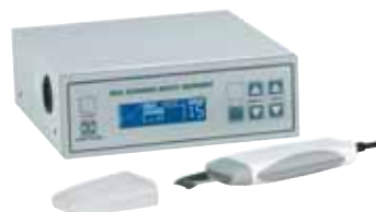
9368 Ultrasonic Exfoliator £349.00