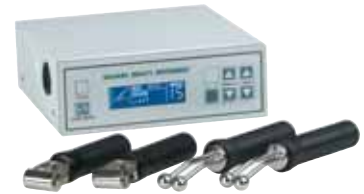
9370 Galvanic £299.00