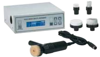
9377 Brush Peeling £279.00