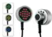
Chromatherapy – four colours – four pulsed modes