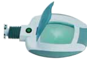
LED Magnifying Lamp