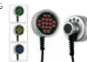
Chromatherapy – four colours – four pulsed modes