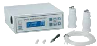
9378 Vacuum & Spray £349.00