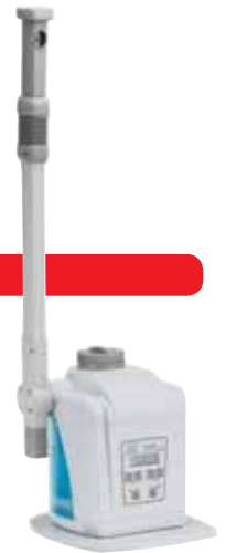
Digital Facial Steamer

PLUS 2, 4, OR 6 OF THE FOLLOWING FACIAL MACHINES