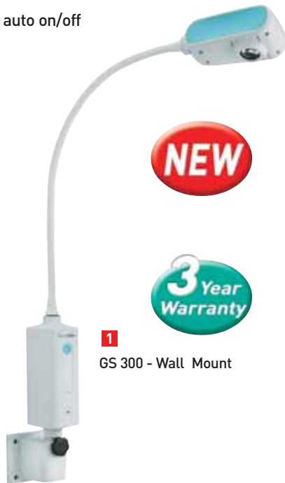
1 GS 300 - Wall Mount