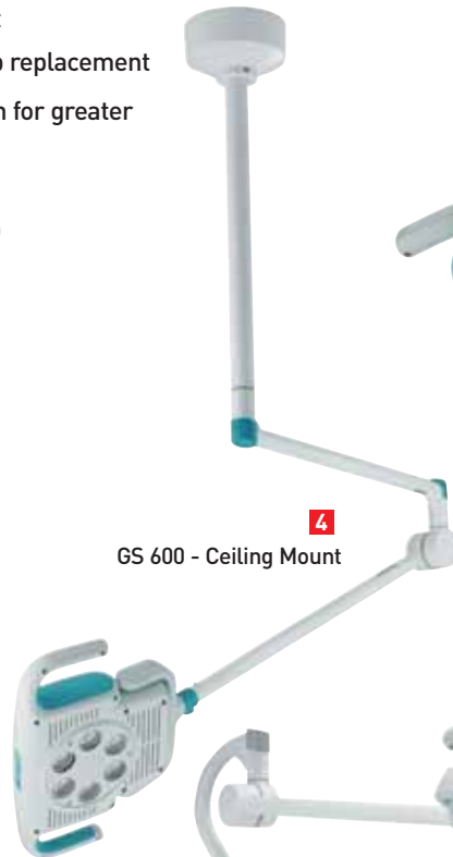
4 GS 600 - Ceiling Mount