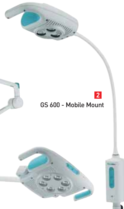
2 GS 600 - Mobile Mount