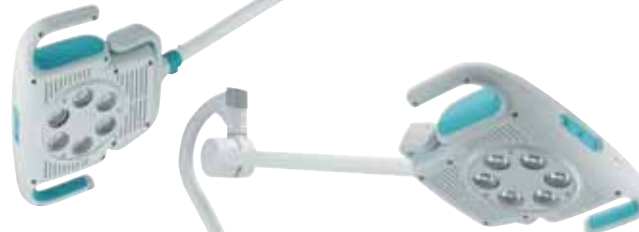
3 GS 900 - Mobile Mount