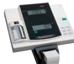
seca 764 with printer